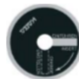
Fig. 3: Change label

Insert the change activator with the long side into the activator hole at the inner door. Turn the change activator approx. 90° to the RIGHT until it stops.