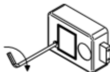
Fig. 2: Change activator